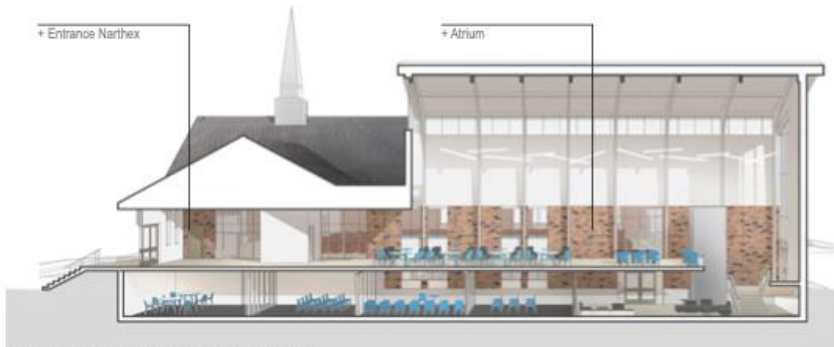
LONGITUDINAL SECTIONAL PERSPECTIVE

This is for the Holy Family Community so it is important we hear from you! We look forward to hearing your feedback.