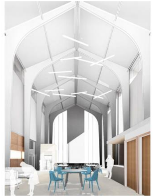
INTERIOR ATRIUM VIEW