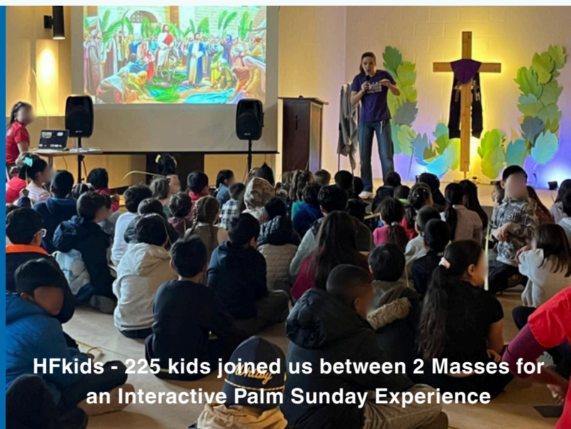
HFkids - 225 kids joined us between 2 Masses for an Interactive Palm Sunday Experience